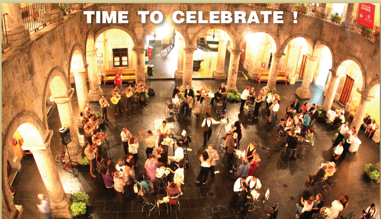
April 6, 2011, Guadalajara's City Hall. "Palacio de Gobierno", IAA delegates celebrating the results of the 17th GA